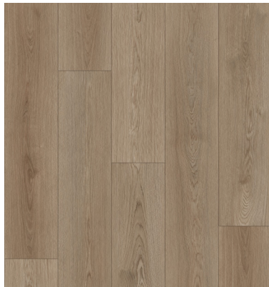
Galaxy Oak | TP3006