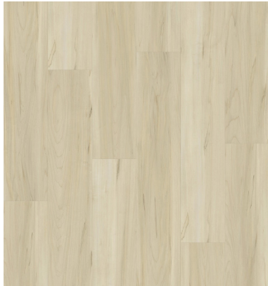
Nebula Maple | TP3001