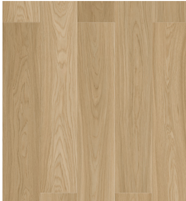
Solar Oak | TP3003