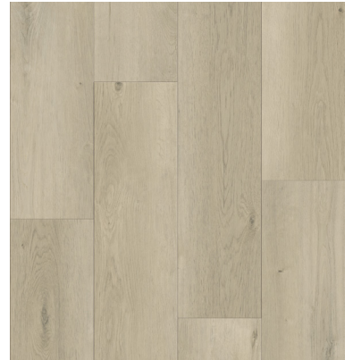
Astronomer Oak | TP3004