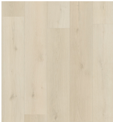
Interstellar Oak | TP3007