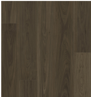
Cosmic Walnut | TP3005